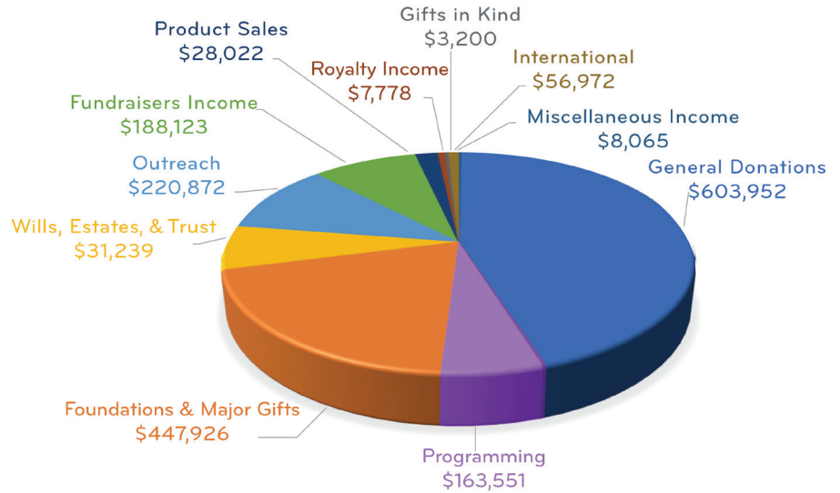
Total 1,759,700 *unaudited figures