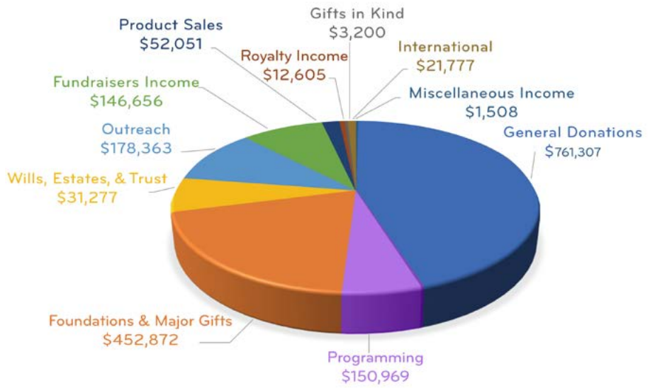
Total 1,812,585 *unaudited figures